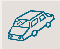
Second hand cars or repairs

Loans can NOT be used for cash, debt consolidation, holidays or bills.